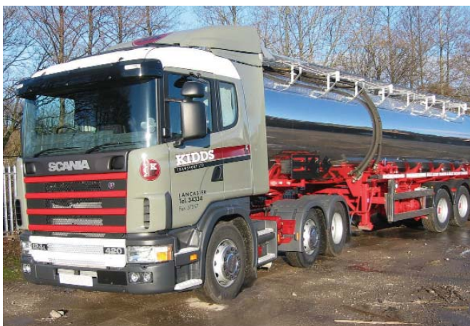
Kidds Transport 6 axle articulated tanker

Kidds Transport is a Lancaster-based company employing 30 drivers and runs a 12-hour operation from Monday to Friday.