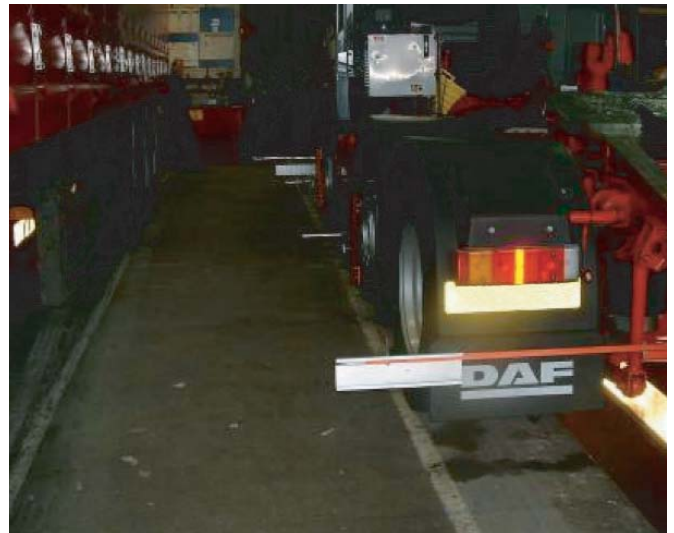
Tractor unit undergoing wheel alignment

However, owing to the sensitivity of the laser wheel alignment process, the fault was identified and rectified. The fault was found to be that the nearside front wheel was misaligned. Following positive results at this depot the company now puts all of its vehicles through wheel alignment at every pre-MoT inspection at all 20 depots.